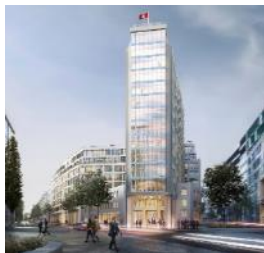
Springer Quartier Hamburg